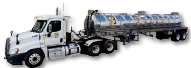
6,400-Gal Vacuum Tanker