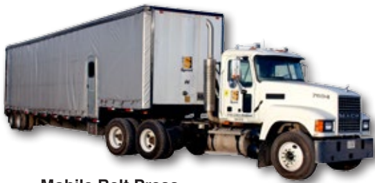
Mobile Belt Press